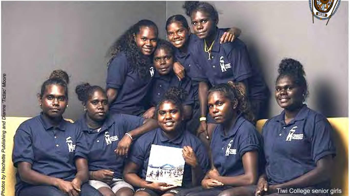
Tiwi College senior girls

Photos by Hachette Publishing and Dianne 'Tictac' Moore