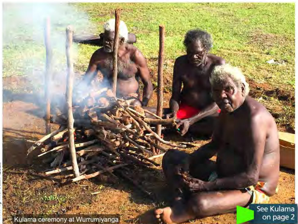
Kulama ceremony at Wurrumiyanga