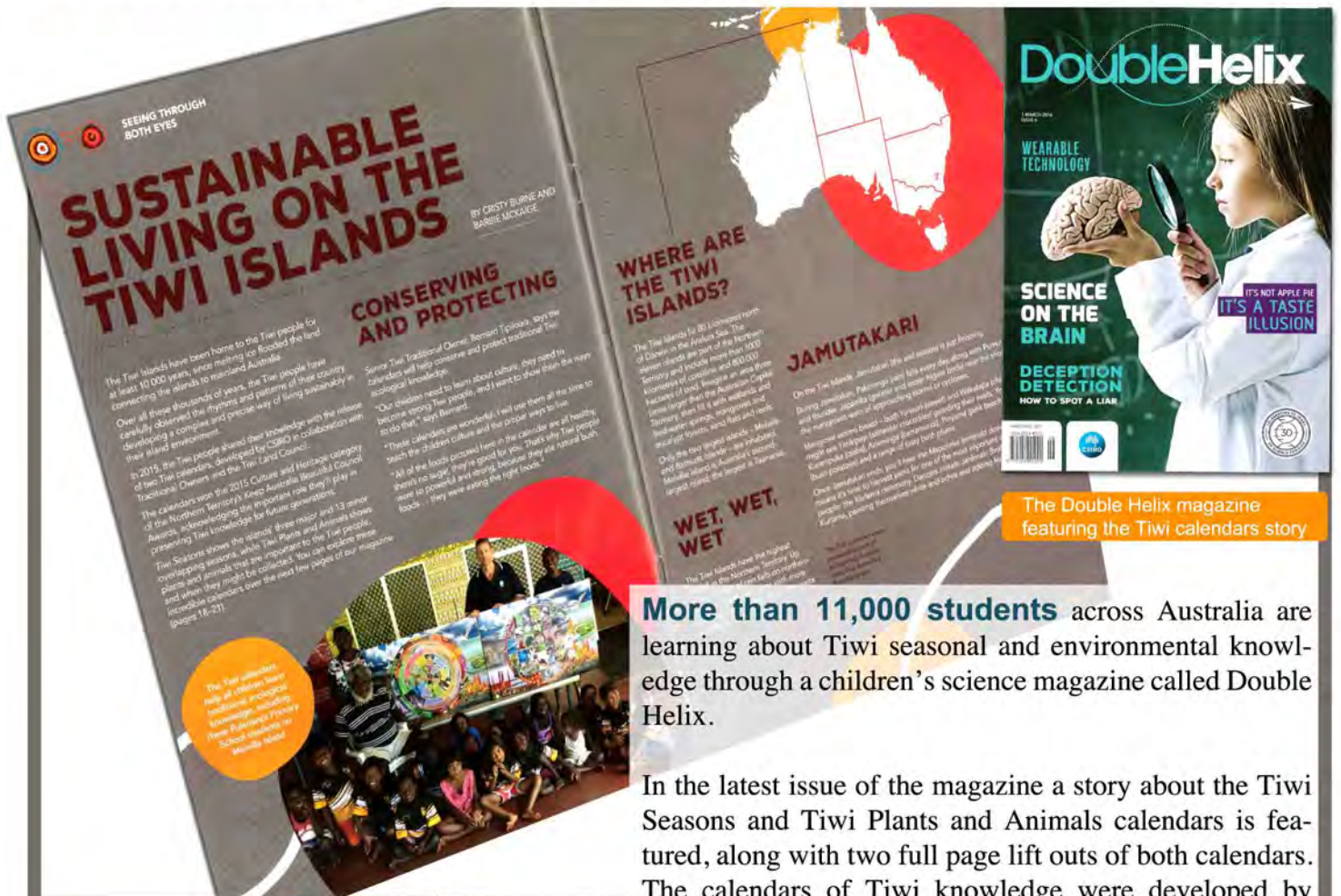
The Double Helix magazine featuring the Tiwi calendars story

More than 11,000 students across Australia are learning about Tiwi seasonal and environmental knowledge through a children’s science magazine called Double Helix.