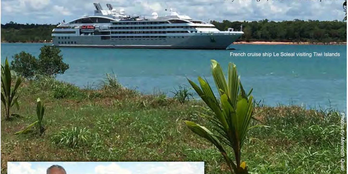
French cruise ship Le Soleal visiting Tiwi Islands