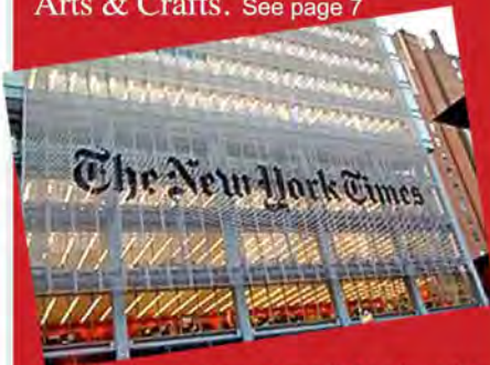
The famous newspaper's headquarters in New York City

The International New York Times reports about Jilamara Arts & Crafts. See page 7