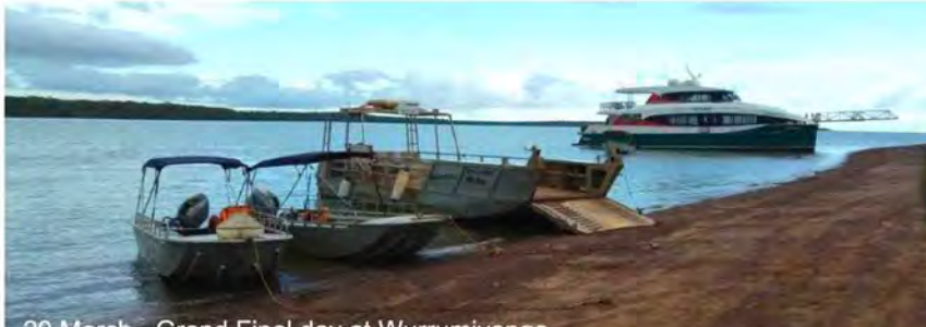
20 March - Grand Final day at Wurrumiyanga

Tiwi Grand Final Sunday, 20 March 2016 Wurrumiyanga