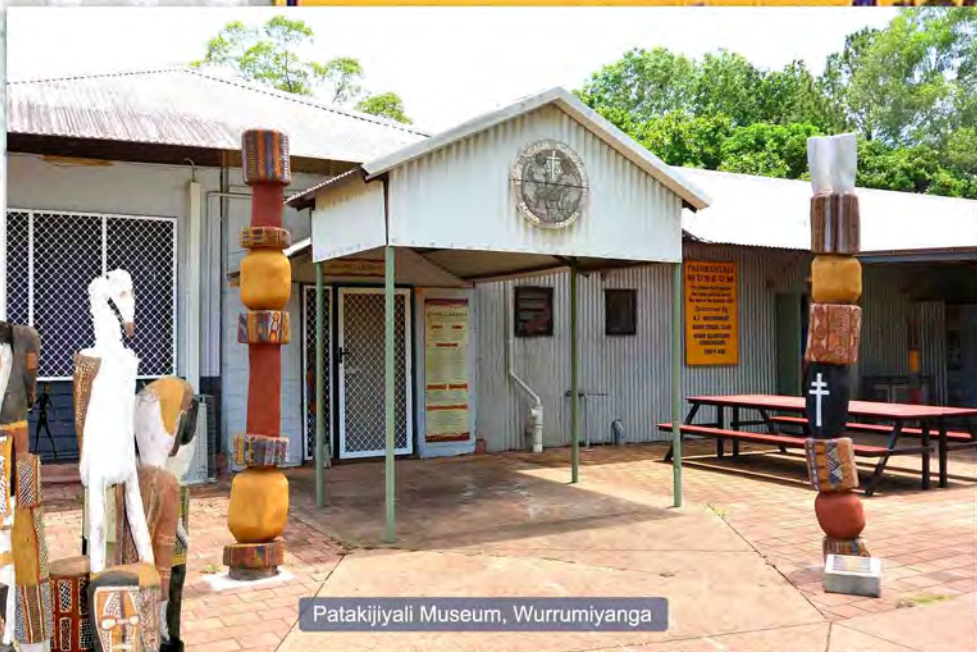
Patakijiyali Museum, Wurrumiyanga