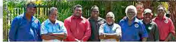
Tiwi Land Council Executive Management Committee

It's almost time to start gearing up for the dry season! Lots of good times ahead.